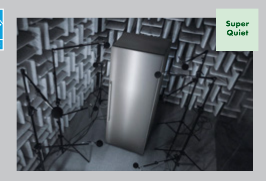
SuperQuiet: Noise levels are kept to a minimum thanks to virtually silent, speed-controlled, and sound absorbing compressors. Alongside a low noise cooling circuit, these features ensure exact performance, energy efficiency, and SuperQuiet operation.

Energy Star: The entire line of North American Liebherr appliances meet or exceed ENERGY STAR <sup>®</sup> rating requirements, greatly reducing greenhouse emissions and energy costs.